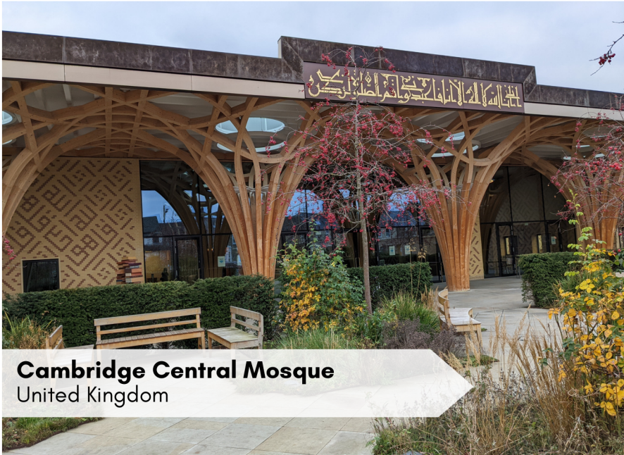
Cambridge Central Mosque United Kingdom