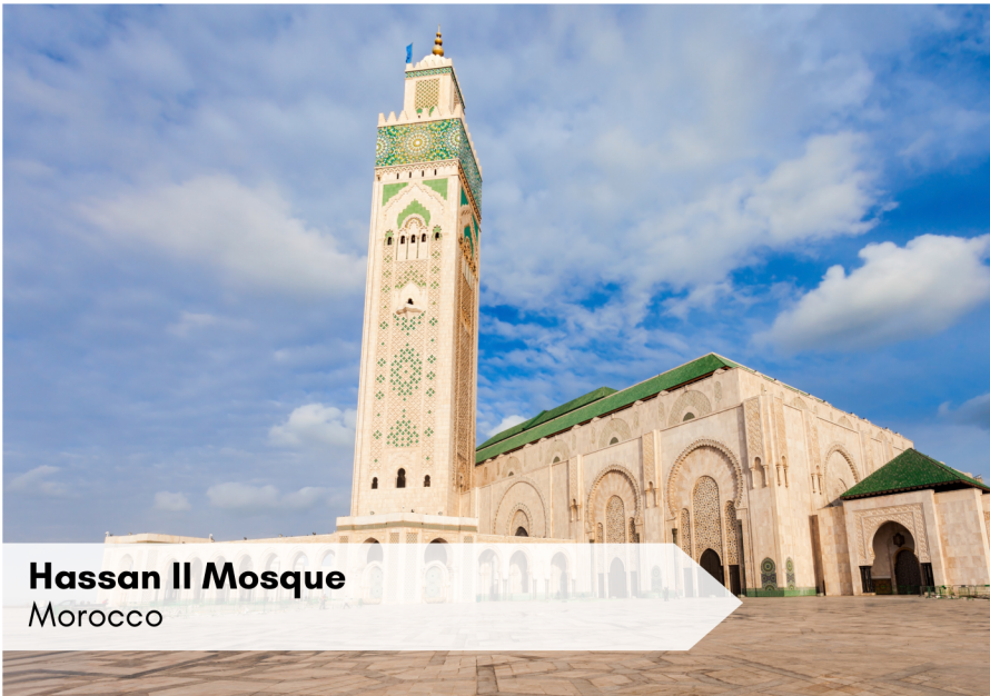
Hassan II Mosque Morocco