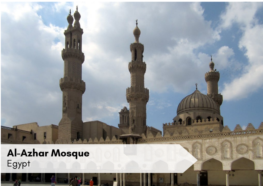
Al-Azhar Mosque Egypt