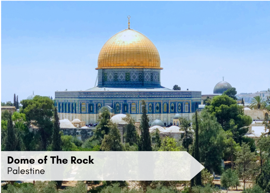
Dome of The Rock Palestine