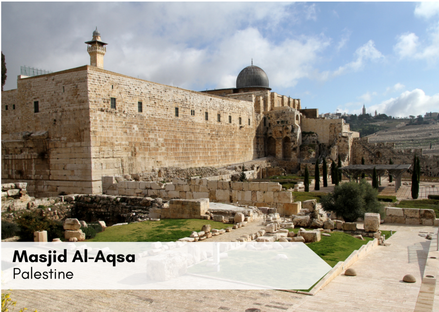
Masjid Al-Aqsa Palestine