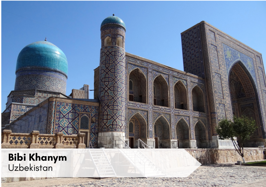
Bibi Khanym Uzbekistan