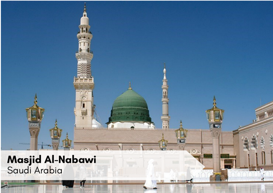
Masjid Al-Nabawi Saudi Arabia