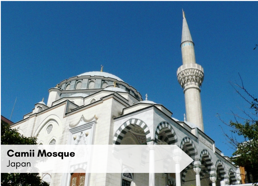
Camii Mosque Japan