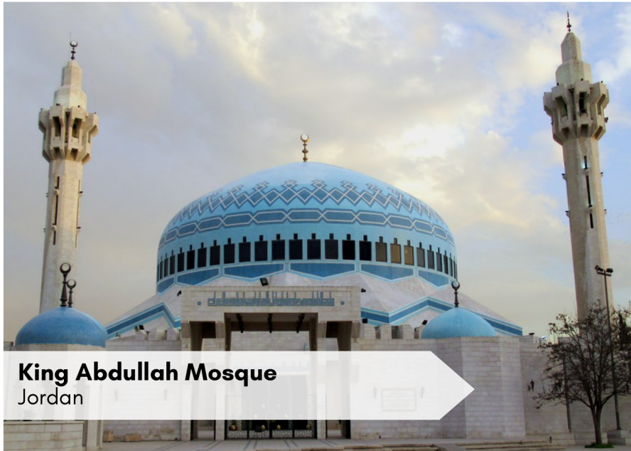
King Abdullah Mosque Jordan