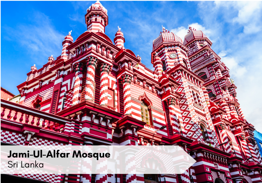
Jami-Ul-Alfar Mosque Sri Lanka