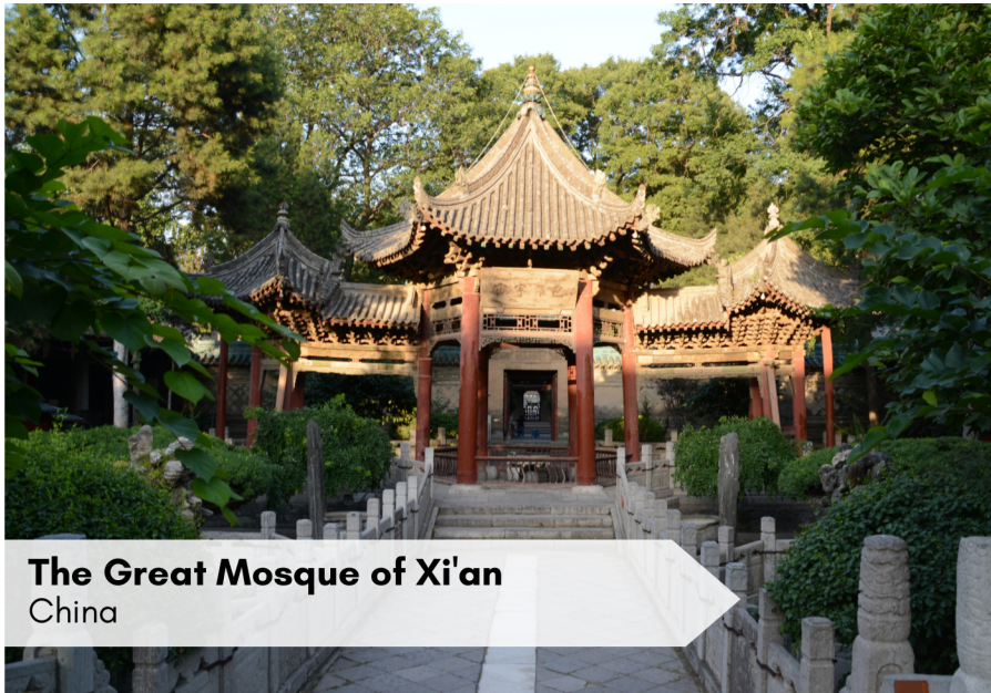
The Great Mosque of Xi'an China