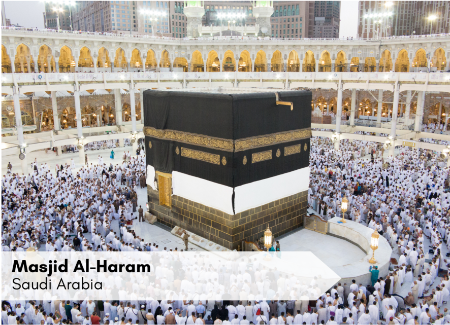
Masjid Al-Haram Saudi Arabia