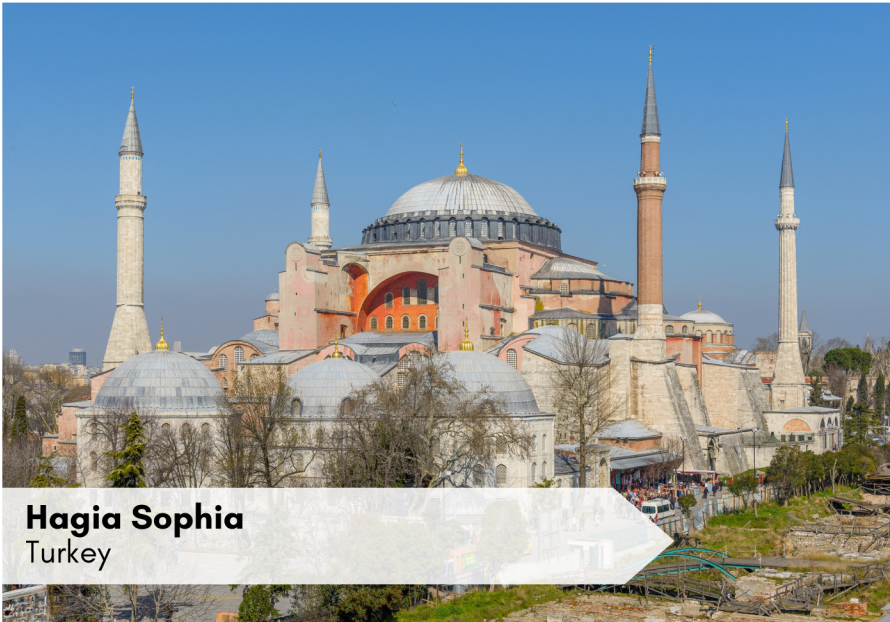
Hagia Sophia Turkey