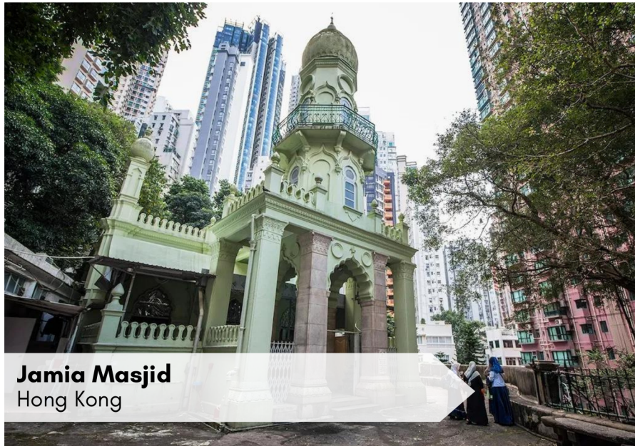
Jamia Masjid Hong Kong