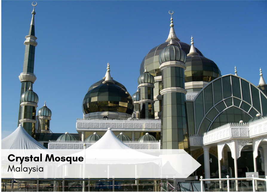
Crystal Mosque Malaysia