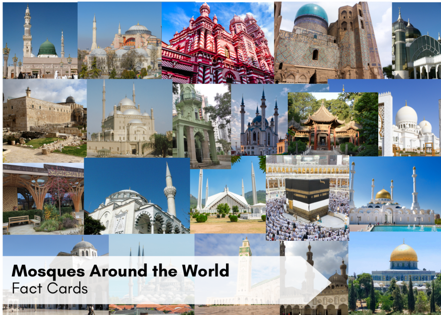
Mosques Around the World Fact Cards