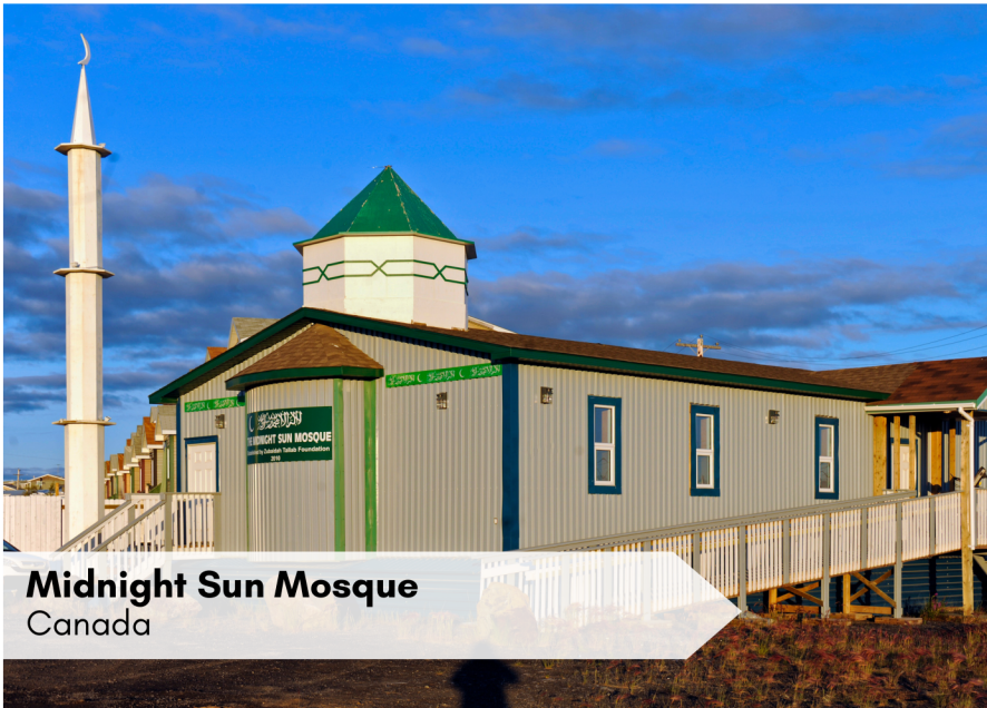
Midnight Sun Mosque Canada