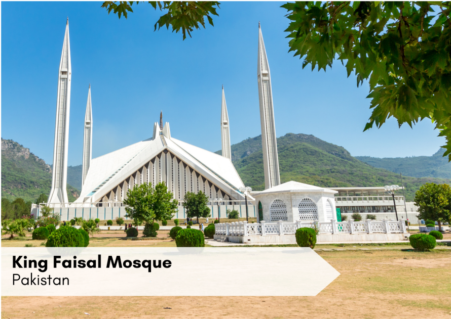
King Faisal Mosque Pakistan