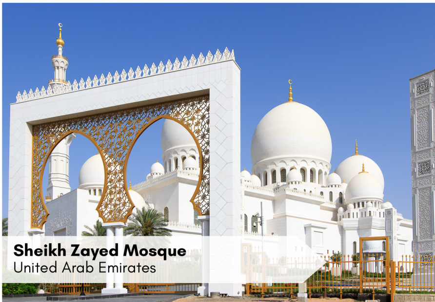
Sheikh Zayed Mosque United Arab Emirates