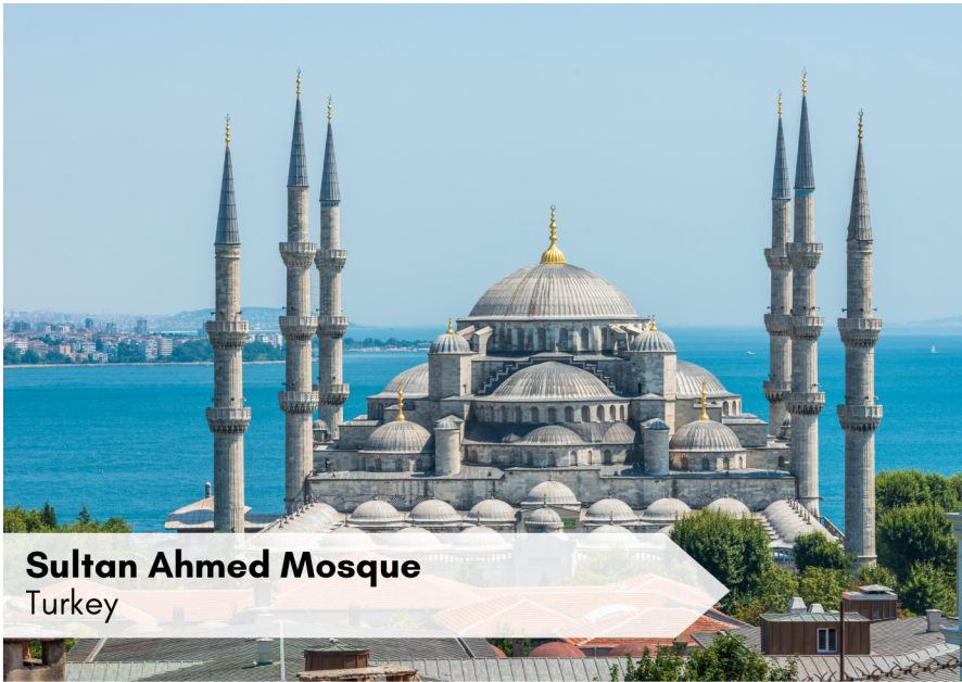
Sultan Ahmed Mosque Turkey